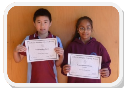
Award Recipients Assembly Monday 2 March