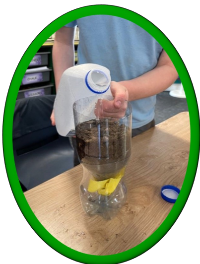
Self watering plastic pots to grow peas