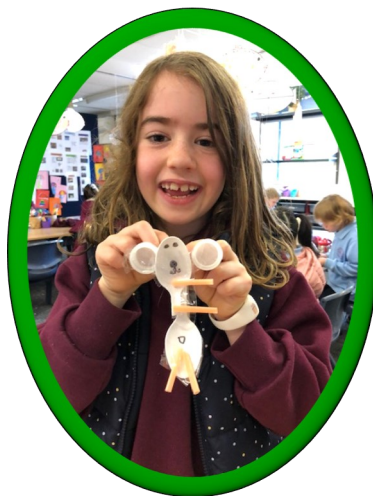
Using recycled materials to create art