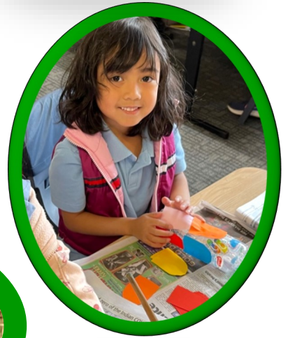
Repurposing rubbish to create Chinese dragons for HASS