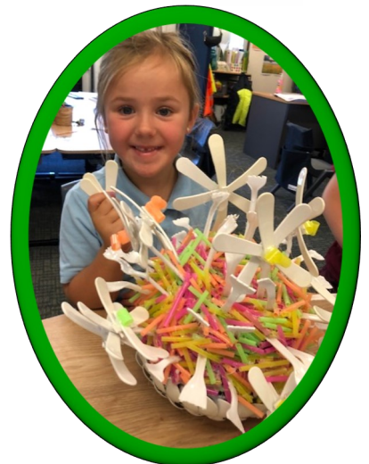
Creating artworks to promote the ban of all single use plastics in SA.