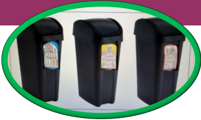
New recycling bins in the JP