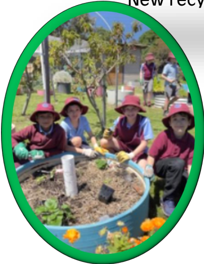
Growing our own food