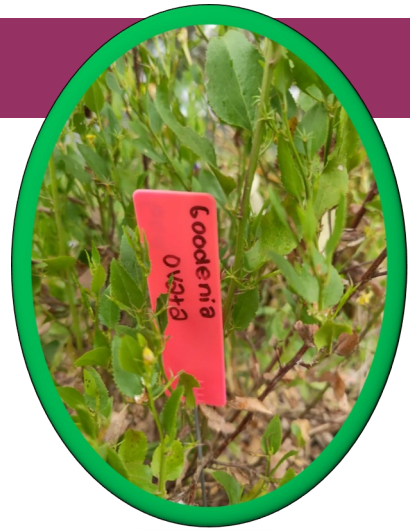
Planting indigenous natives